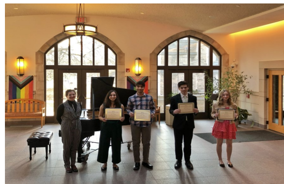
Congratulations to our Seniors, Class of 2024!