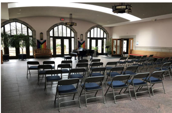
Asbury First United Methodist Church - 1:30 recital

Phone/text (585) 203-6030 or email beth@bethfischerpiano.com